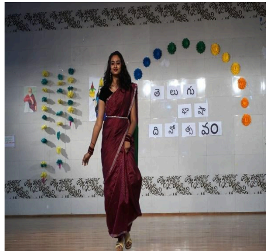
Cultural Walk 2.0