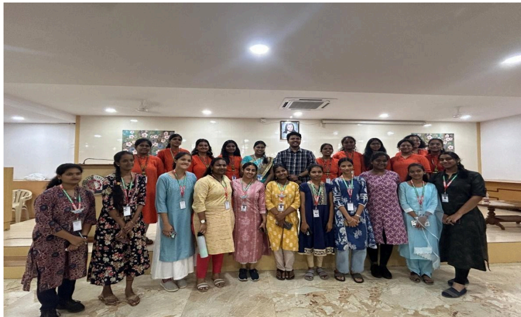
Harivillu core committee and Telugu students with resource person.