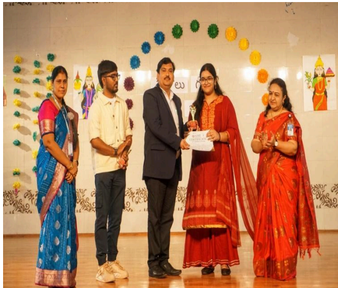
Winners of various competitions being awarded