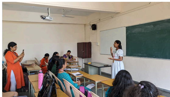
Telugu veera Levara competition