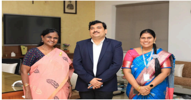
Our Principle Ma'am & Chief Guest