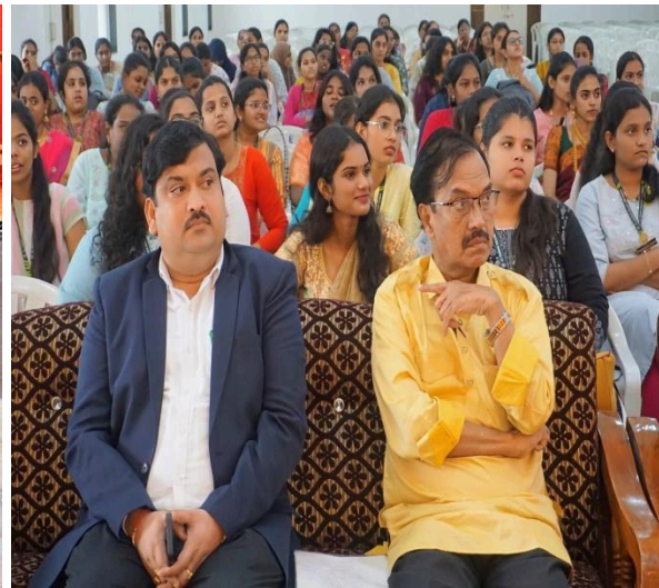
Chief Guest and Guest of Honor