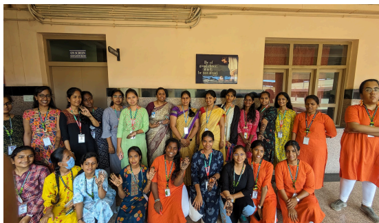
Mehendi competition Participants along with the club Coordinator