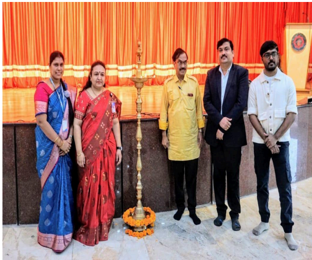
Lighting of the lamp by the Guests